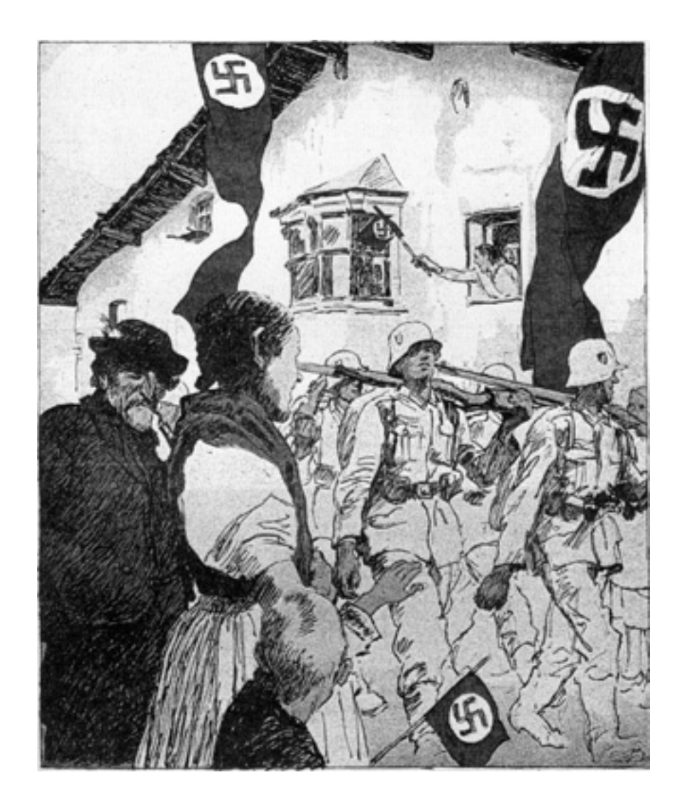
A drawing with the title 'The fulfillment', published in a German magazine, 3 April 1938. It shows German troops entering Austria. An Austrian is saying that he has waited for this since 1918, and now it has happened in one blow.